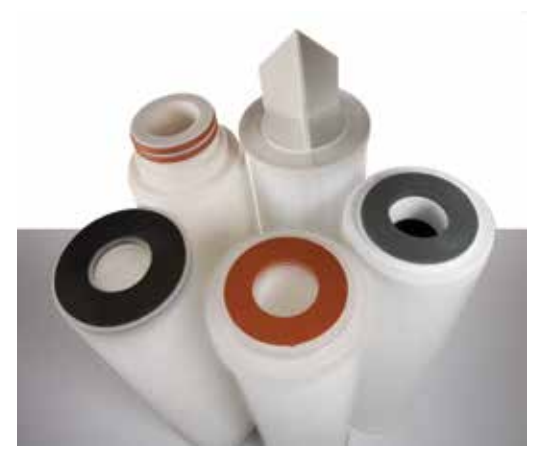
LOFPLEAT AG filter catridges are available with a variety of gasket. O-ring and end cap configurations